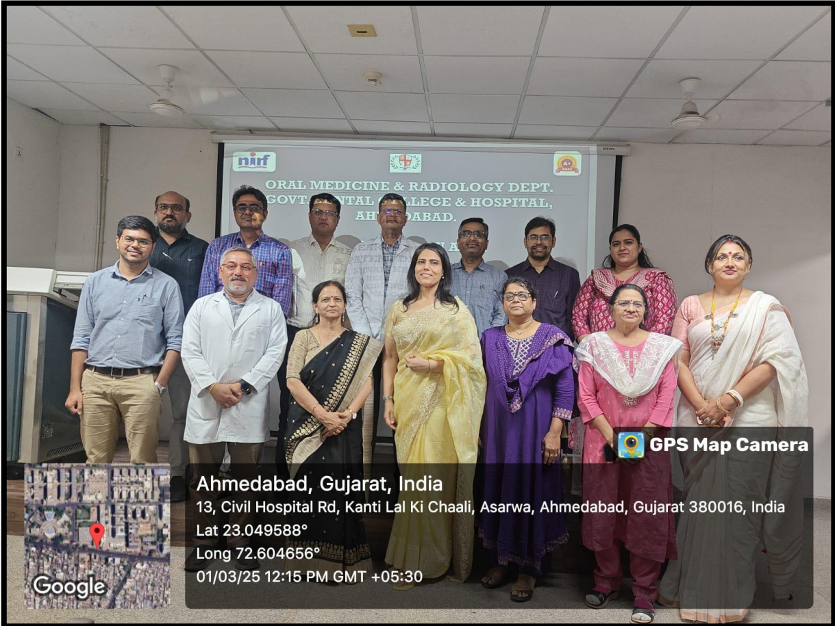
Ahmedabad, Gujarat, India 13, Civil Hospital Rd, Kanti Lal Ki Chaali, Asarwa, Ahmedabad, Gujarat 380016, India Lat 23.049588° Long 72.604656° 01/03/25 12:15 PM GMT +05:30