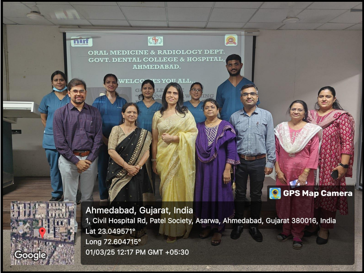
Ahmedabad, Gujarat, India 1, Civil Hospital Rd, Patel Society, Asarwa, Ahmedabad, Gujarat 380016, India Lat 23.049571° Long 72.604715° 01/03/25 12:17 PM GMT +05:30