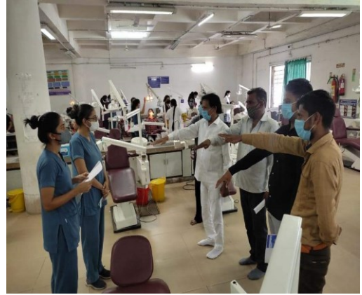
Live demonstration of tobacco cessation and oath taking