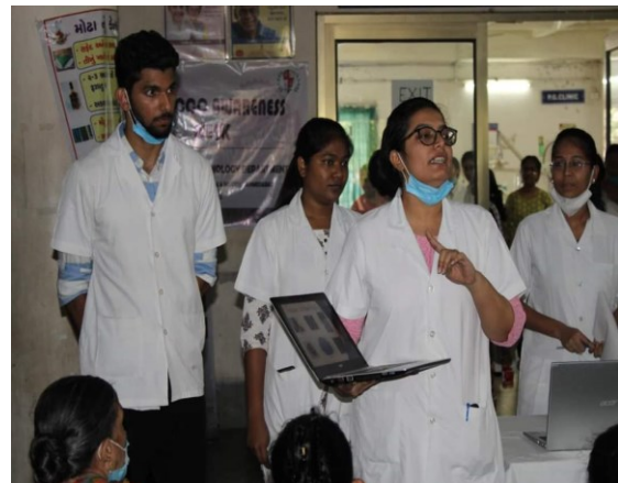
Power point Presentation & Pamphlet distribution