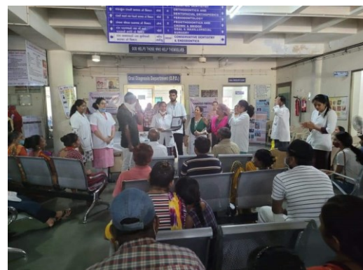
Patient to patient counselling