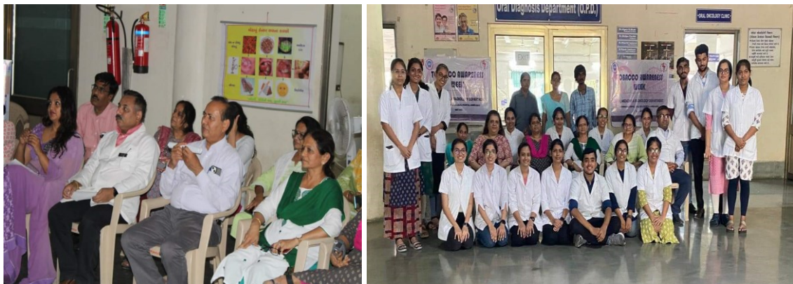
Tobacco awarness week