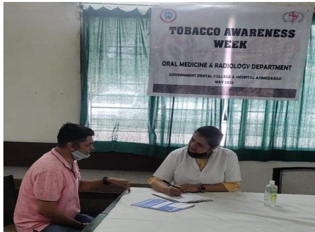
Questionnaire (Research Study) - “Awareness regarding tobacco consumption”